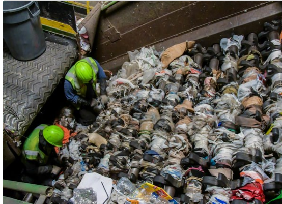
Workers removing tangled plastic bags from equipment.