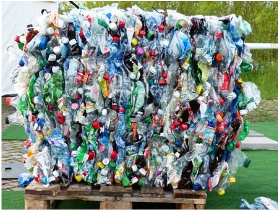
Baled plastic bottles to be sold.